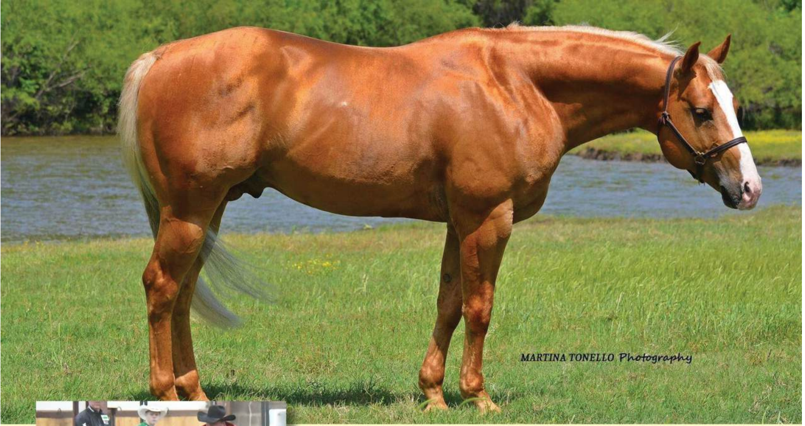
MARTINA TONELLO Photography